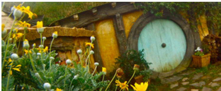
Hobbiton (Matamata), New Zealand

We have the great fortune to be at an institution that deeply values international education. Preparing students to be global citizens requires a diverse faculty with strong intercultural skills and an eagerness to engage globally in research, teaching and collaborations. It also requires skilled and knowledgeable advisers who are passionate about international education.