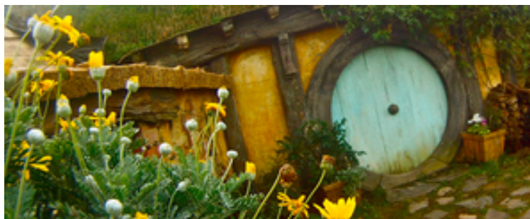
Hobbiton (Matamata), New Zealand

We have the great fortune to be at an institution that deeply values international education. Preparing students to be global citizens requires a diverse faculty with strong intercultural skills and an eagerness to engage globally in research, teaching and collaborations. It also requires skilled and knowledgeable advisers who are passionate about international education.